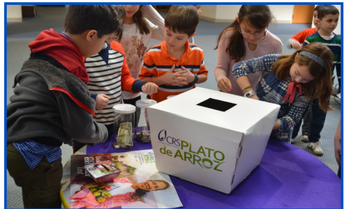
Parishioners of all ages participated in the Lenten Rice Bowl, Catholic Relief Services' Lenten faith-in-action program through which prayers, fasting, and alms support those in need throughout the world.

Thank you to the Women's Guild of St. Mary for their generous gift of the Mary Garden.